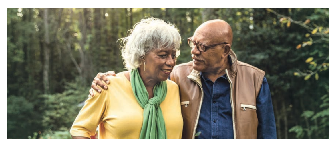
The Retirement Wave is Here: Are You Prepared?

In this issue, we are excited to provide you with three new pieces to assist you in your role as a Plan Sponsor. These materials will cover a variety of topics: The surge in recent retirements that may affect your company, the impact this retirement wave has had on workers, and the maximum benefit and retirement contribution limits for 2022.